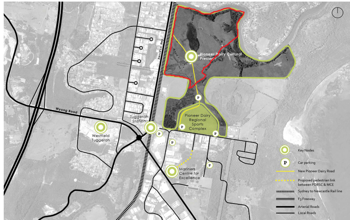
Figure 4: Displays the relationship and separation between Lot 1 DP 1186260, acquired by Council for regional sporting and recreational facilities, and the area of Significant Heritage Curtilage , located to the North of the land and shown by red boundary, within Lot 3 DP 1186260 (Refer Figure 2).

In summary, the Planning Proposal involves the following amendments to the WLEP 2013: