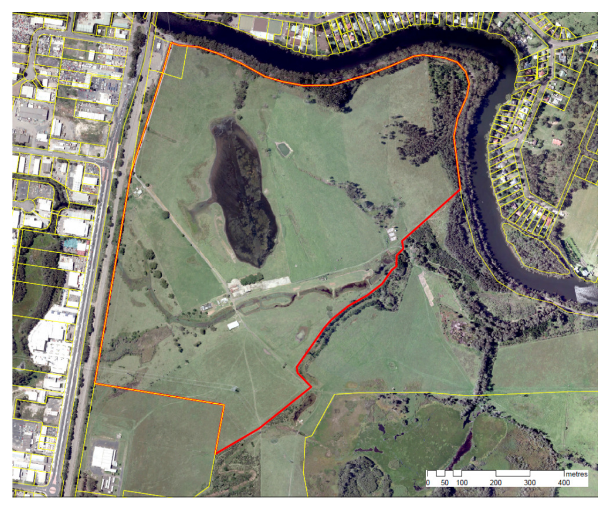
Figure 3: The area of Significant Heritage Curtilage is located in the Northern portion of the land, as defined by the red boundary depicted on the aerial photograph, located within Lot 3 DP 1186260 (see also Figure 4 below).

In order to better define the compatibility of both proposed and existing uses on site, a Heritage Architect was engaged to provide a Significance and Heritage Curtilage Assessment to examine the significance of the remaining structures and surrounding grazing land (refer Attachment 7). This resulted in the identification of the "Significant Heritage Curtilage" surrounding the Heritage Precinct (refer Figure 3), which contains the original dwelling house and sleepout, silos and milking bays. This curtilage covers approximately 8 Hectares of land and includes adjacent grazing lands within the visual catchment, reflecting the historic usage of the land.