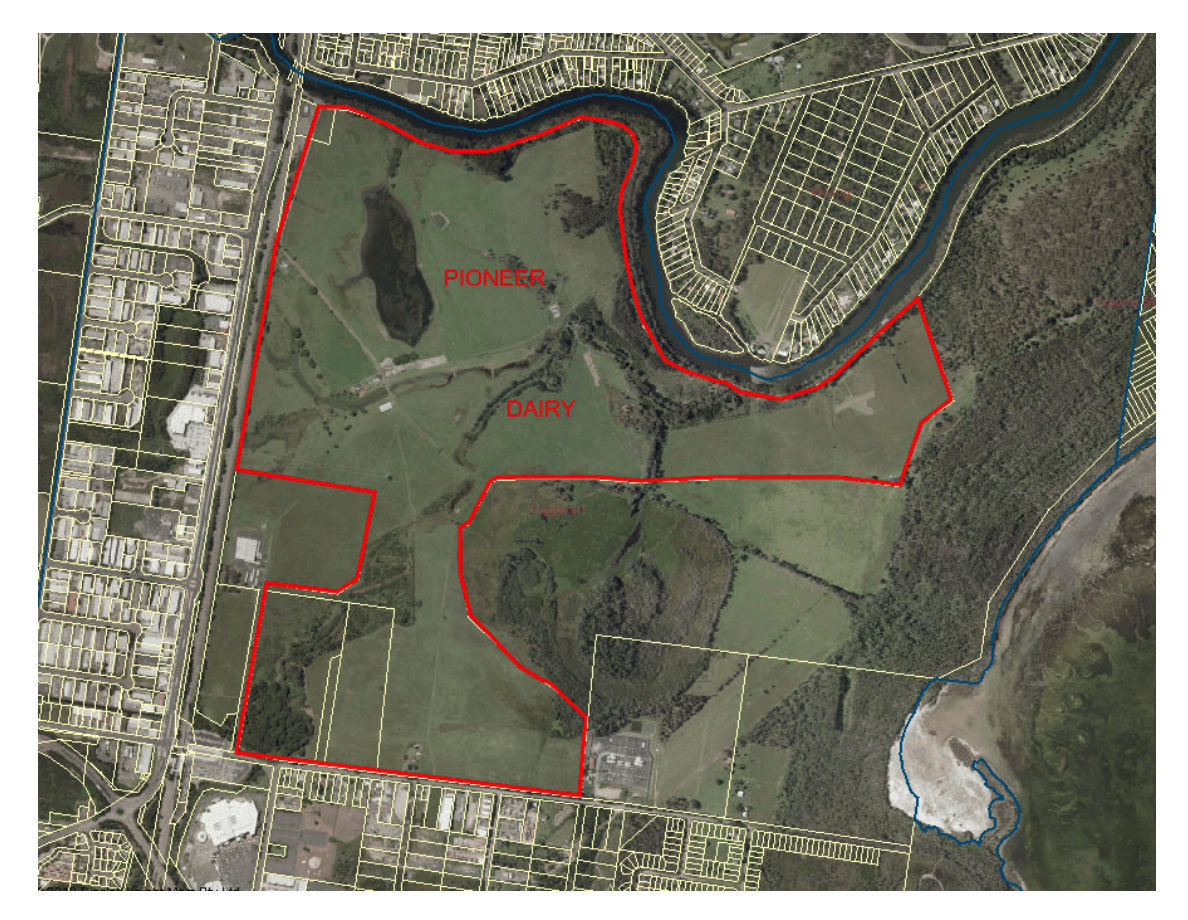
Figure 1: Site Location.

The Trust intends to continue to use the site for environmental education and to generate funding sources for the upkeep and development of the land through activities which may include community meetings and functions, historic talks and tours, tea rooms, organic produce and craft markets, artist/sculptor exhibits and musical performances, community gardens, wetland education and sustainability centre, picnicking, bird-watching, and so on.